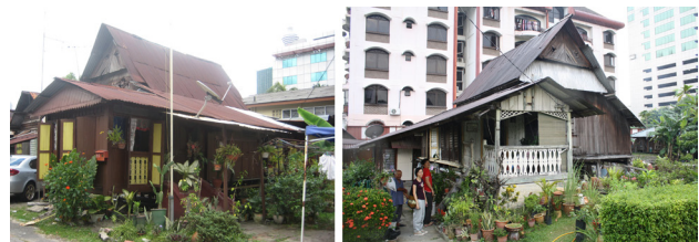
Fig.8. A Traditional Vernacular House: Bumbung panjang house (H11, A13)

The pillars are indigenous wood pillars and are comparatively neither high nor thick. The staircases connecting to the anjung are very simple wooden structures (Fig.8.).