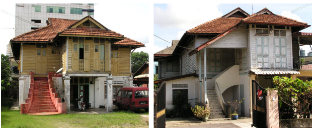
Fig.10. A Colonial Vernacular House (A9, A17)

This style originated in the Anglo-Indian bungalows built in the early 1800s and later evolved into the 'Straits Eclectic' style due to the social, ethnic and cultural change occurring in colonial Malaya. During that period, a combination of the Chinese, Malay, Indian and European architectural styles was adopted through the memories of immigrant owners and their pattern books. Houses were designed according to the owner's taste, which resulted in a unique and eclectic style. This typology is a hybrid of Malay and Colonial culture. Further research will address more specific classifications in this typology (Fig.10.).