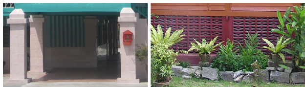
Fig.6. Transformation of Pillar (H1, A24)

It is worth noting that some vernacular houses addressed the issue of ventilation underneath the floor by closing the sides using modern perforated bricks. We could not identify this design in traditional Malay houses (Fig.6.).