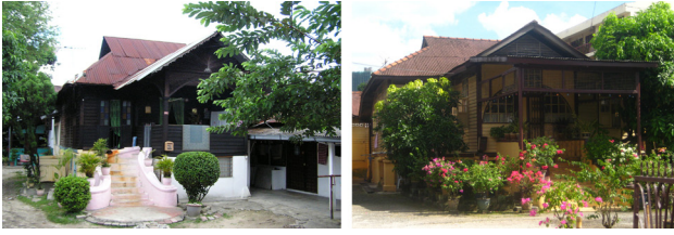
Fig.9. A Traditional Vernacular House: Bumbung perak house (M21, A7)