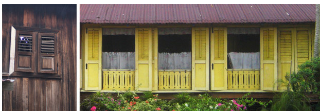
Fig.4. A ' Tingkap ' (A13: Left) and ' Jendela ' (A16: Right)

The façade order can be divided into three parts: top, middle and bottom. The top part contains carved and latticed panels for ventilation, while the middle and bottom parts consist of windows.