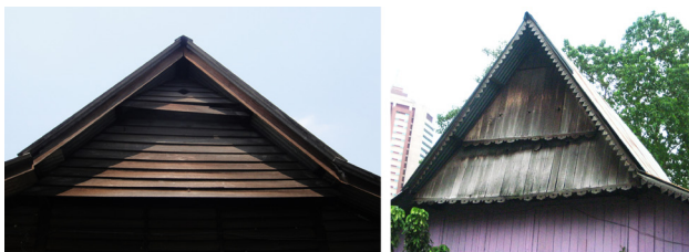
Fig.3. ' tebar layar ' (M3, R20)

Regarding roof decorating elements, wooden panels, called ' tebar layar ' 15 on the gable ends of a traditional Malay house, served as a passage for ventilation as well as important sculpture decorations for the façade. These decorations, however, were simplified or often closed with wall panels (Fig.3.).