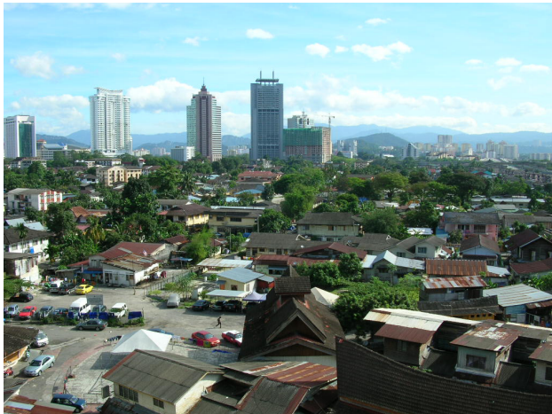
Fig.2. The View of the Kampong Bharu

Therefore, it is very urgent to study and document the existing traditional houses in Kampong Bharu.