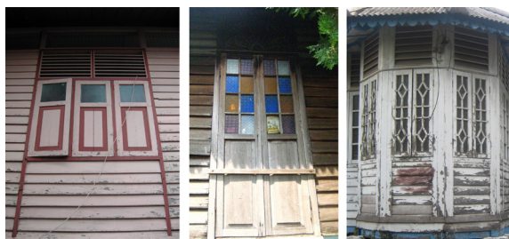
Fig.5. Transformation of Wall (Y5, M21, and M22)

There are three major types of windows: the 'Tingkap' (short window), the 'Jendela' (tall window) and the punched window. The balustrades behind the shutters, made from carved wooden strips or perforated planks, have an aesthetic value besides being used for safety purposes (Fig.4.).