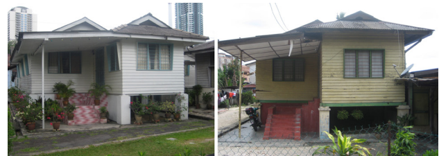
Fig.11. A Modern Vernacular House (Y13, Y4)

There are no wooden pillars in this typology. Usually the underneath is walled or consists of concrete pillars that extend to form walls. The main entrance staircases can have different materials or simpler designs, but they generally follow the Malay traditional layout. Variations exist in this typology and it still needs to be classified in more detail (Fig.11.).